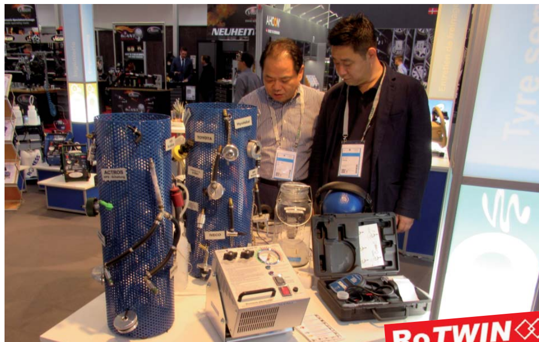
Not only the RoTWIN devices from ROMESS were in the spotlight at the stand at the Automechanika in Frankfurt for customers from all over the world, but also the extensive range of accessories that sets ROMESS apart from the competition.