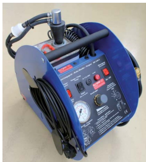
BW 1408 is the "secret weapon for mobilen brake maintenance service - handy and strong.

Das BW 1408 HY was specially developed for use on commercial vehicles equipped with a hydro-pneumatic shift and clutch system. When changing fluids, HY devices of the ROMESS brand make it possible to work absolutely bubble-free.