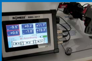
The ROMESS RMG 2017 drive shaft buckling angle gauge generated a great deal of interest at Automechanika.