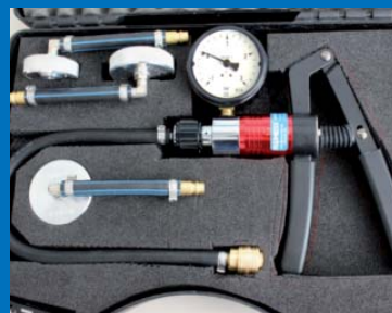
Practical set in case: the ROMESS 4000 cooler tester plus adapter.

Does the cooler leak? This is easy to determine with the ROMESS cooler tester 4000. It measures both pressure and vacuum and comes in a practical case set with matching adapters.