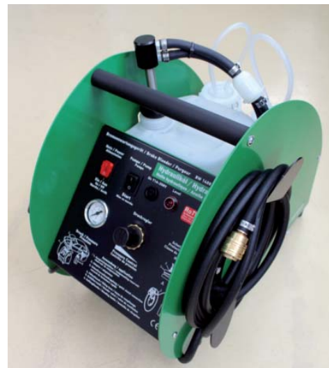
New: the Hydraulic device BW 1408 HY by ROMESS, also equipped with the world wide patent protected RoTWIN-technology.