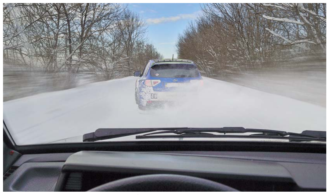
Winter is coming. The cold season creates all sorts of hazards and tricky situations on the road - optimally maintained brakes are the solution.